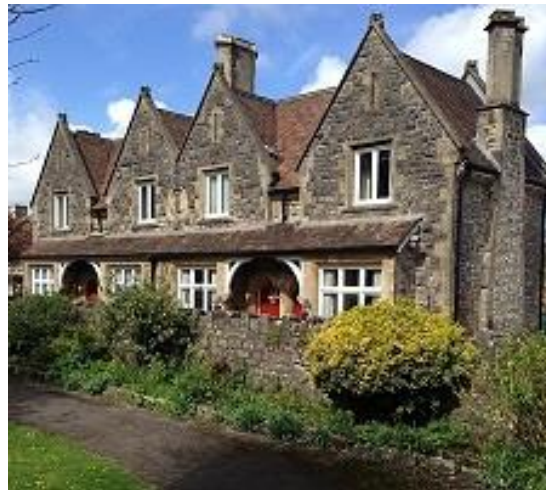
The Wickham Almshouses built in 1868