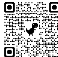
Newsletter QR Code

https://mailchi.mp/u3a/your-u3a-festive-friends-newsletter-2024?e=e8a96fa897